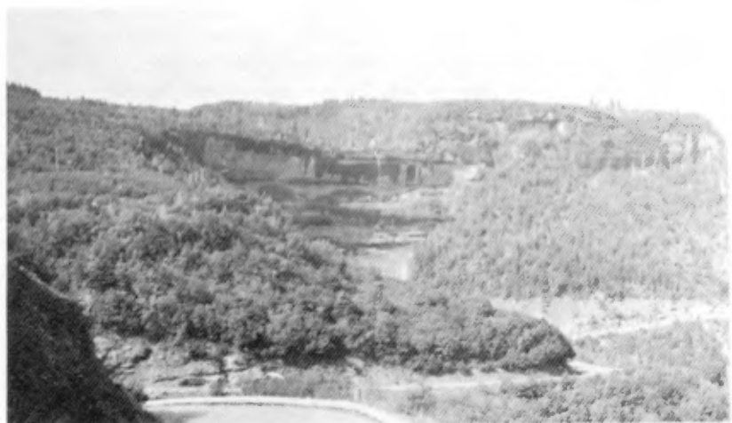
Plate V — The head of the Grande Coupe is cut in Carboniferous (Bonaventure) rocks and serves as a base for part of Route 6.