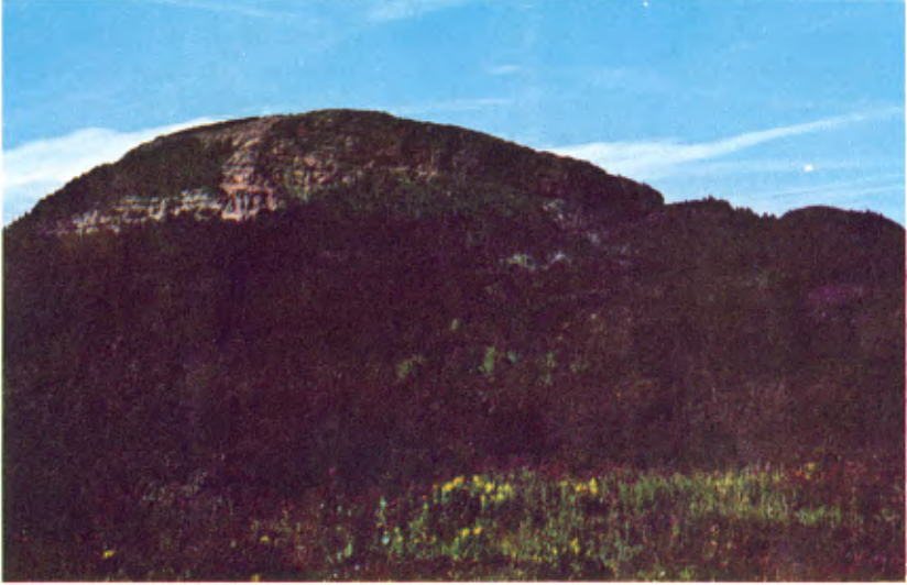
Plate I — Mount Ste. Anne from the southeast showing Carboniferous Bonaventure Formation dipping (slanting) gently to the north.