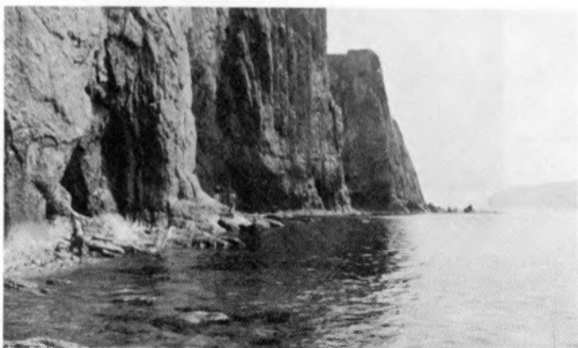
Plate XI — Southwest side of Percé Rock from 500 feet north of the hole showing vertical to steep southwest dip (slant) of the rock layers (Devonian age). The sea-stack at the outer end of the Rock is to the right in the photo. Bonaventure island in the background.