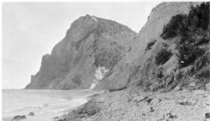
Plate IV — The Grande Coupe valley (middle of photo) separates Ordovician rocks (cliff in foreground) from the Pic de l'Aurare sea-cliff and its content of Ordovician, Devonian, and Carboniferous rocks.