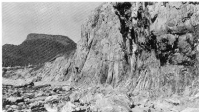
Plate XIV — The Ordovician rocks on the south side of Cape Canon have been crushed, broken, and sheared by folding movements. Note the abundant calcite veins (white) filling fractures in this rock. Mount Ste. Anne in the background.

proW (or inner end) where it is 288 feet. Some land forms above 210 feet also suggest marine terracing.