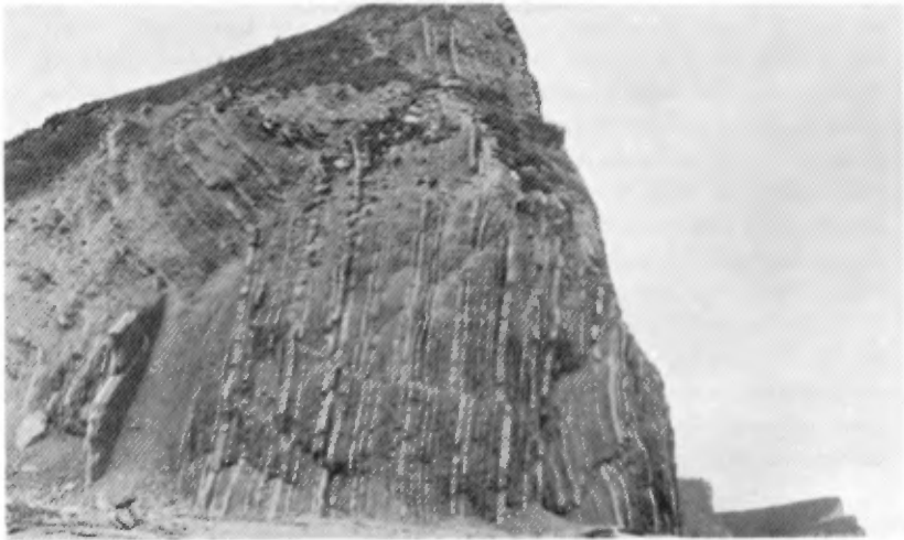
Plate XII — The alternating silty to sandy and shaly (darker) layers of Cape Mont Joli dip steeply southwest. Devonian rocks. Local offsets of layers mark minor faults.