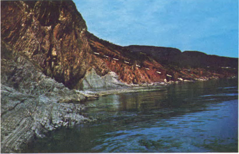
Plate III — Unconformity (indicated by dashes) between overlying, younger Carboniferous rocks (dipping gently to the north) and the older Ordovician rocks (dipping steeply to the south). Neither color nor black-and-white show this unconformity clearly because the Ordovician just under the contact with the Carboniferous is stained by iron-bearing solutions that have seeped down from the red Carboniferous rocks. North flank of Cape Blanc (White Head), in the sea-cliff below the Cote de la Surprise Belvedere. Mount Ste. Anne in background.

above the seas in which they were deposited, and then subjected to erosion before the Bonaventure muds, sands, and gravels were spread across them and, later, hardened into rock. The band of Cambrian rocks mentioned above actually marks the crest of an anticline (upfold) and upturned Ordovician and Silurian rocks appear in succession outward from this crest. The steeply dipping Devonian rocks of Percé Rock and the Murailles are on the northern limb of this major fold (Percé anticline). The southern limb is represented only near the axis of the fold — the rest is covered by the Bonaventure Formation.