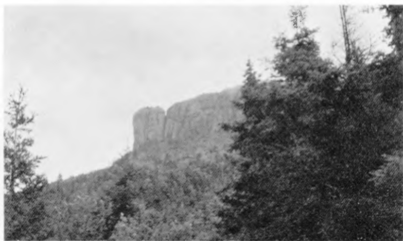
Plate VIII — Looking east to "La Crevasse" from Falle Road.