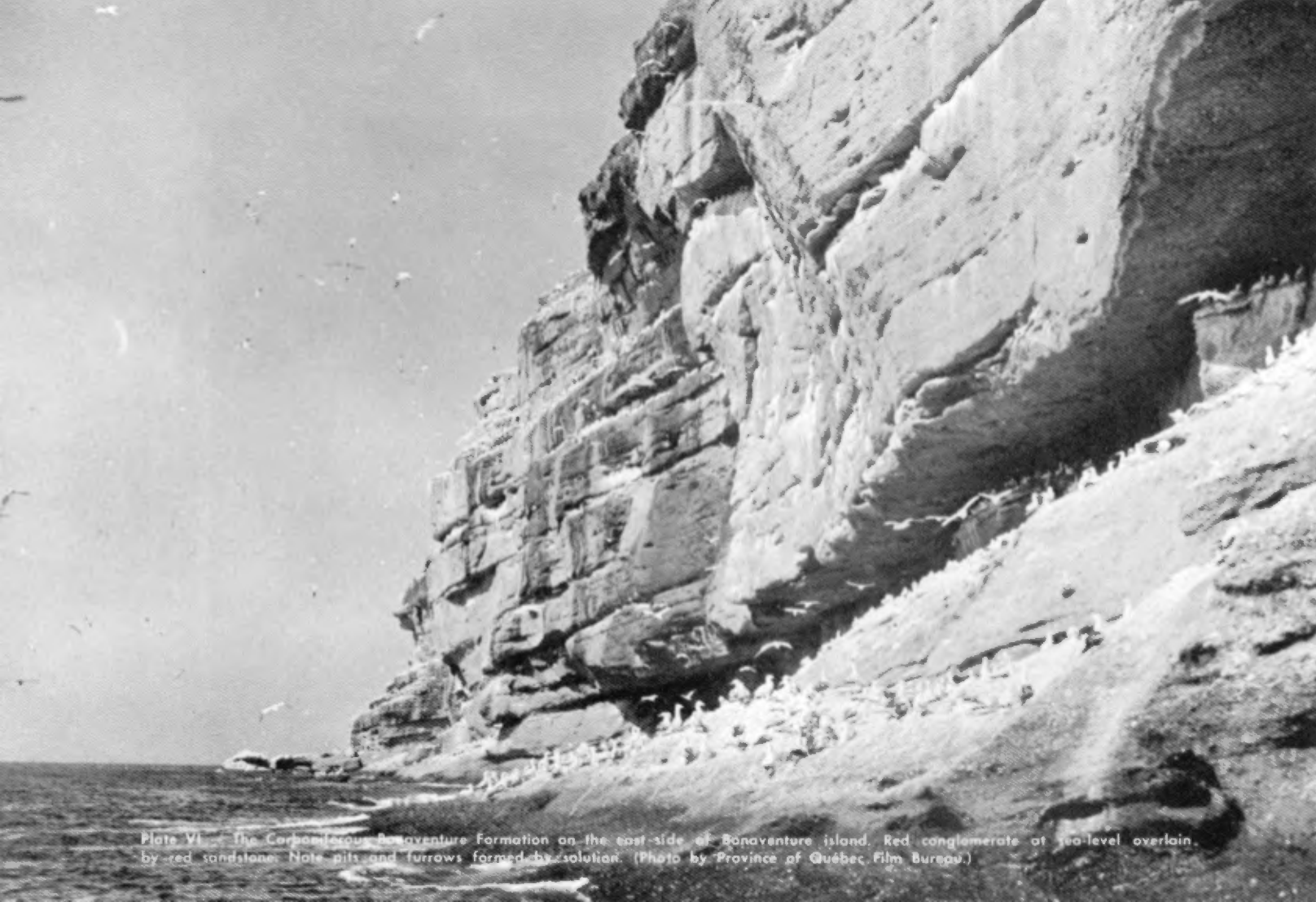
Plate VI - The Carboniferous Bonaventure Formation on the east side of Bonaventure island. Red conglomerate at sea-level overlain by red sandstone. Note pits and furrows formed by solution.