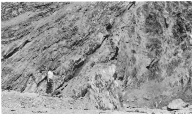
Plate XIII — Thrust fault (trace indicated by dashed lines and direction of movement by arrow) in the Cape Mont Joli cliffs west of Plate XII. Ordovician rocks to the left have been thrust over the Devonian rocks to the right.