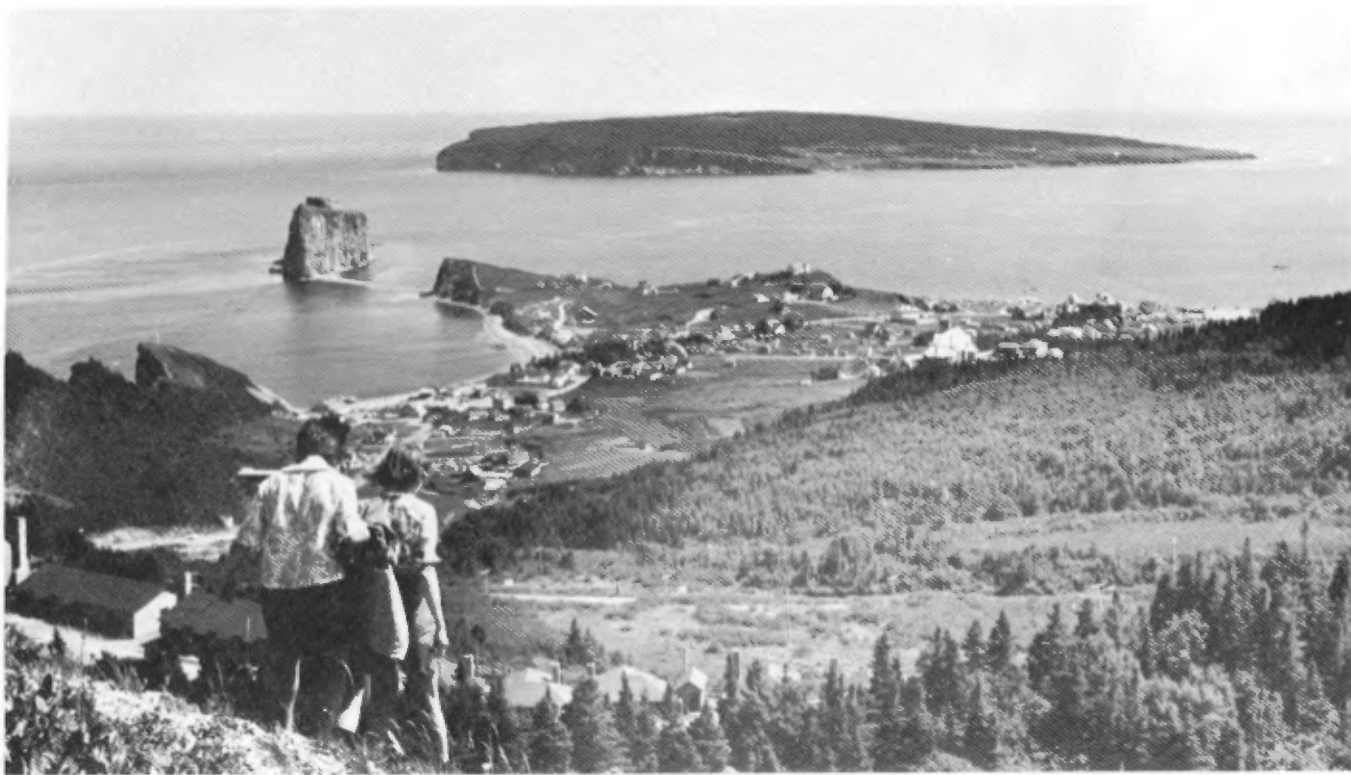
Percé panorama from the Pic de l'Aurore (Peak-of-Dawn). Percé Rock points to Cape Barré and two of Les Trois Soeurs (Three Sisters); Cape Mont Joli is near Percé Rock and Cape Canon is to the right (under the large white house). Bonaventure island in the background.