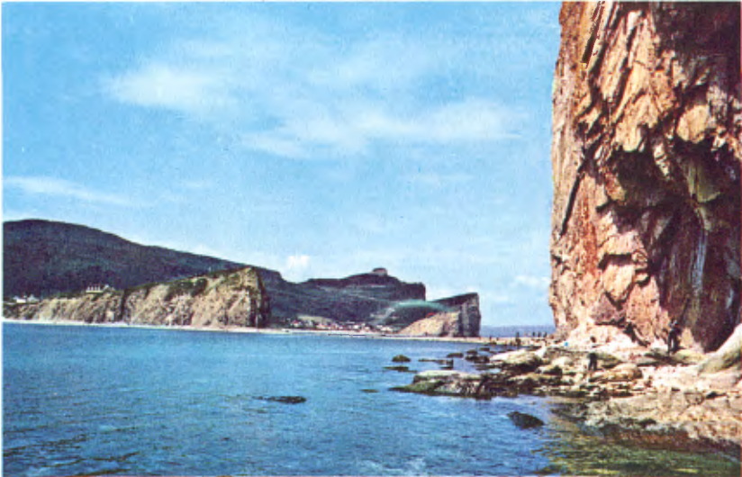
Plate II — Looking north from about mid-length of the west side of Percé Rock. Part of Percé village in the center with Cape Mont Joli in the left foreground and Mount Blanc (rounded) in the left background. Cape Barré and part of Les Trois Sœurs, with the Pic de l'Aurore behind them.