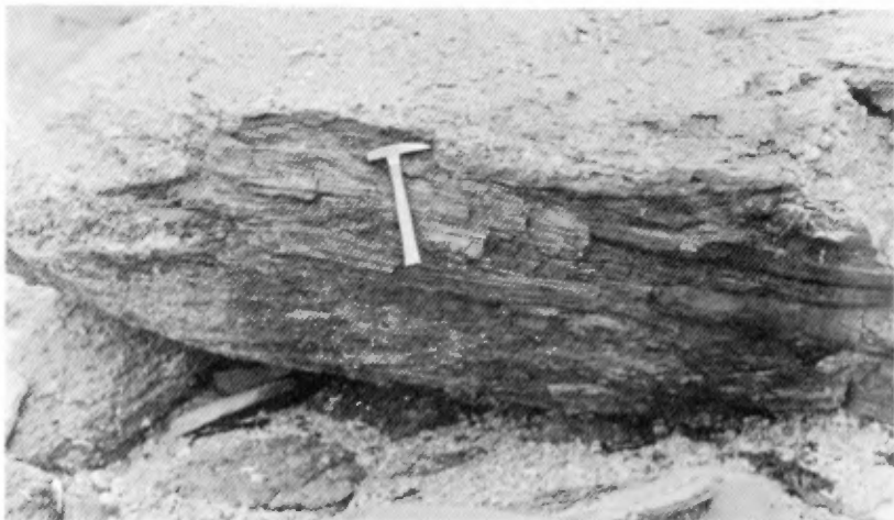
Plate X — Fossil tree trunk in Carboniferous rock. Loose block on beach north of the old Cannes-de-Roches wharf.