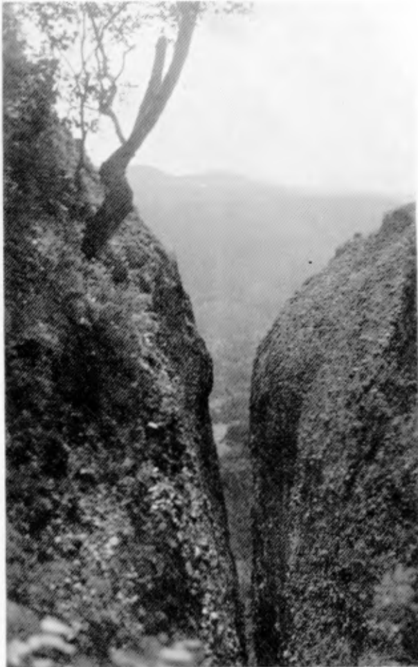
Plate IX — "La Crevasse" in Carboniferous Bonaventure conglomerate.

river and the Murailles it is masked or covered by the Bonaventure Formation. There is no doubt, also, that this formation extended seaward at least as far as Bonaventure island, because it outcrops on the northern tip of the island and almost directly in line ("on strike") with Percé Rock.