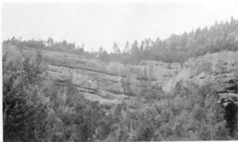
Plate VII — Solution pits and furrows in the Carboniferous Bonaventure Formation in the walls of the "Amphitheatre" on the Falle Road.