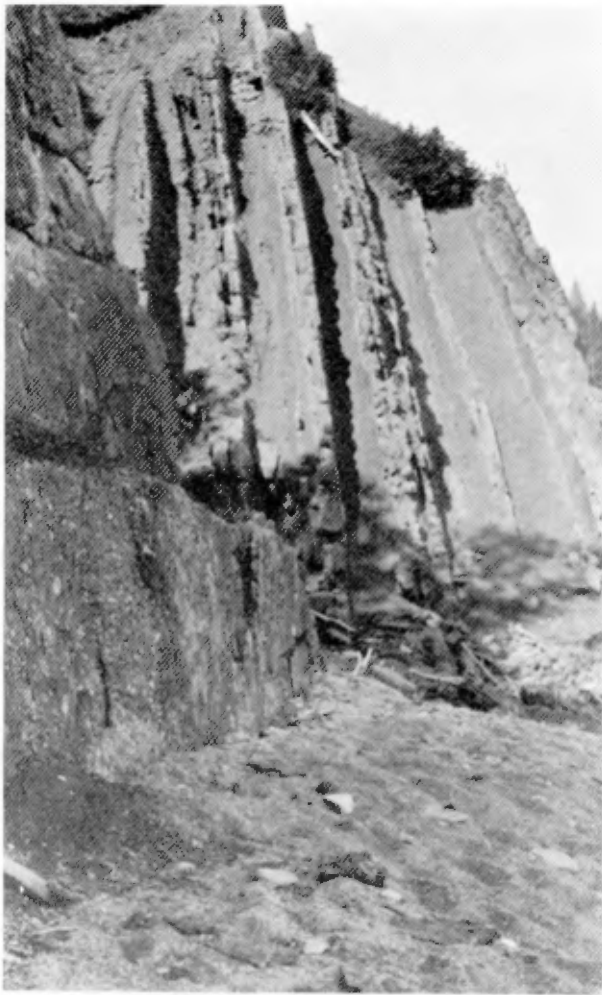
Plate XV — Carboniferous rocks upended along a fault (to the left of the photo) that dropped the Carboniferous down against Ordovician rocks. Cannes-de-Roches shore.